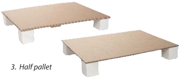
3. Half pallet