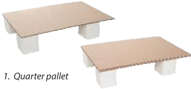
1. Quarter pallet

No return transport cost, no administrative cost. After using puts in compriator with all other corrugated.