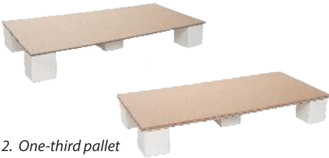
2. One-third pallet